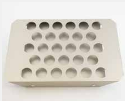
Crucible holder (88600-0015)