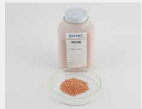
Copper accelerator (90240)